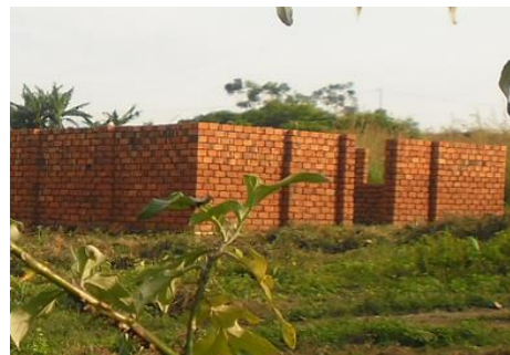
Roofless churches in Fizi (left) and Sebele (right), Sud Kivu, DRC.