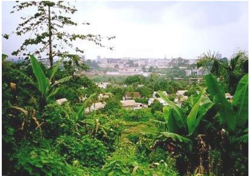
Figure 1View of Yaoundé

In Cameroon, Fr. Alphonse has had to deal with two major concerns raised by the government of Cameroon: the first concerned the licencing of the school, where it is anticipated that demands for the building to be built of durable materials rather than the wood used to date. The second results from the