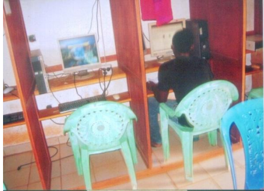
At left, the IT school, and below, children from St. Augustine's school, Yaounde, Cameroon.

As we look ahead to the new school year, here are some more photographs of the last year in Yaounde: