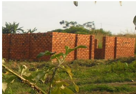
Roofless churches in Fizi (left) and Sebele (right), Sud Kivu, DRC.