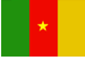
Republic of Cameroon