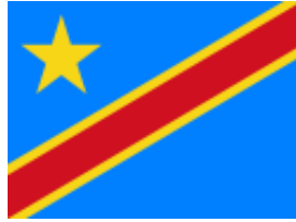
République Démocratique du Congo