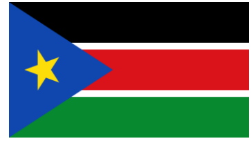
Republic of South Sudan